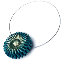
Bry Necklace $250.00