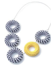
Black and White and Yellow Five Circles Necklace $395.00 SOLD OUT