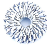
Book Pages Nel Brooch $120.00