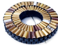
Bittersweet (Chocolate) Brooch $130.00 SOLD OUT